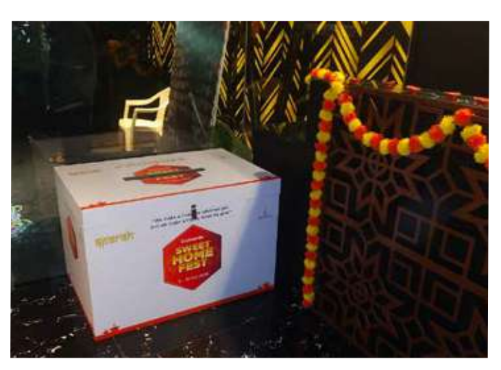
Date: 5th to 31st October, 2019