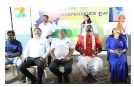
Date: 15th August, 2019