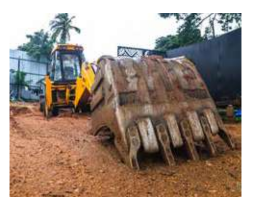
Shot on site, 31st Oct 2019