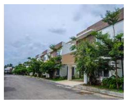
Shot on site, 31st Oct 2019