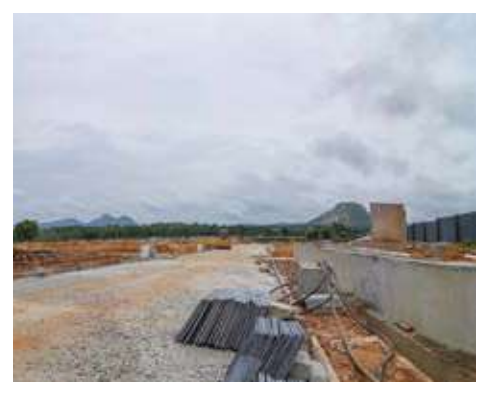
Shot on site, 31st Oct 2019