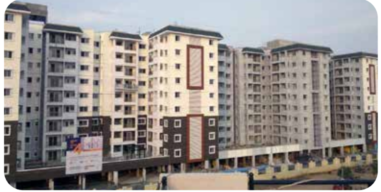
Shot on site, 30th April 2021