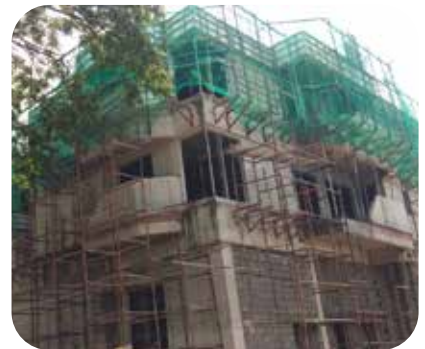
Shot on site, 30th April 2021